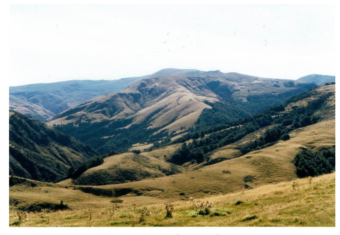
The Junction Glenaray Stn