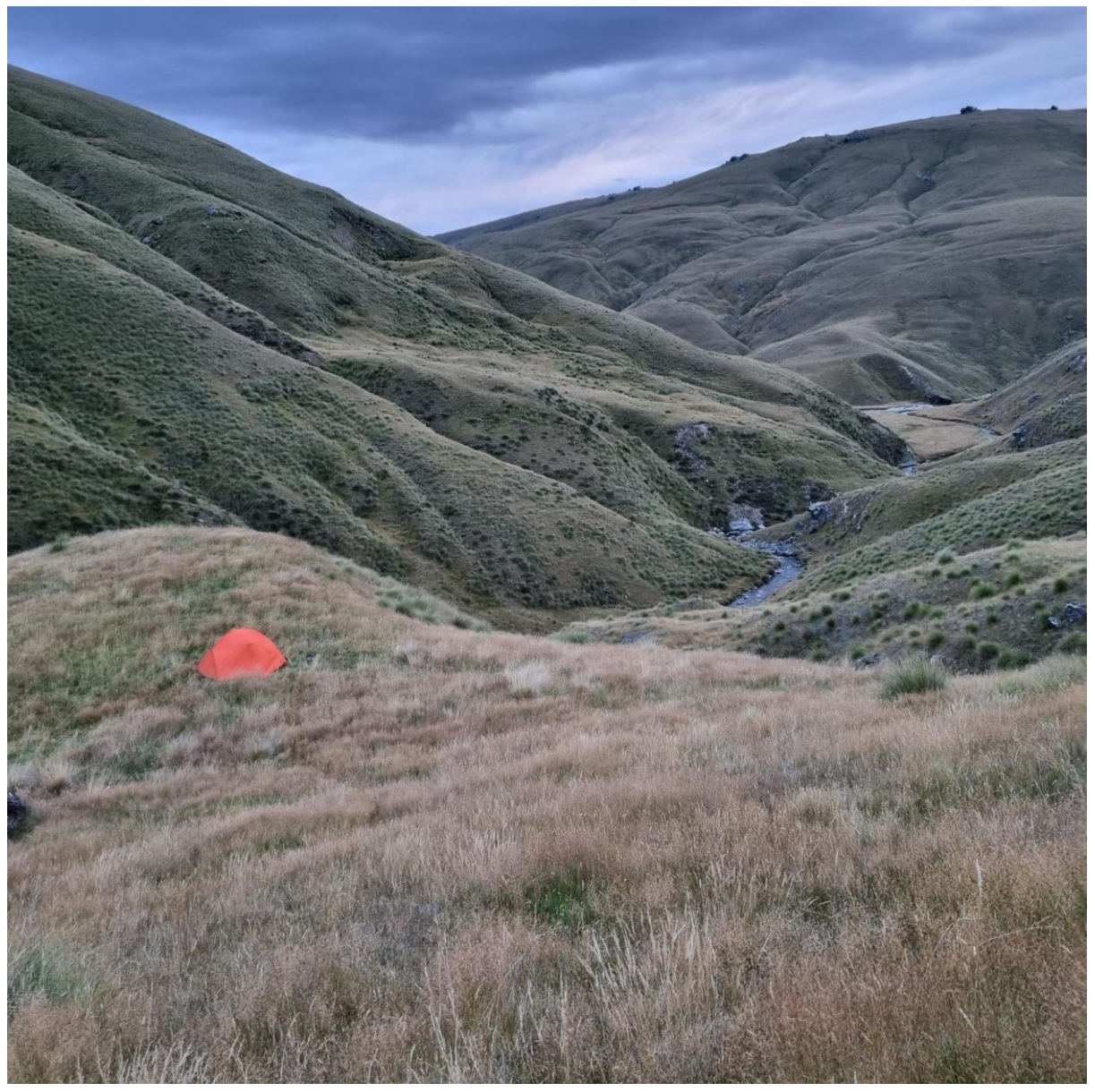
Camp all set up had a hind come within 40m of the tent after dark