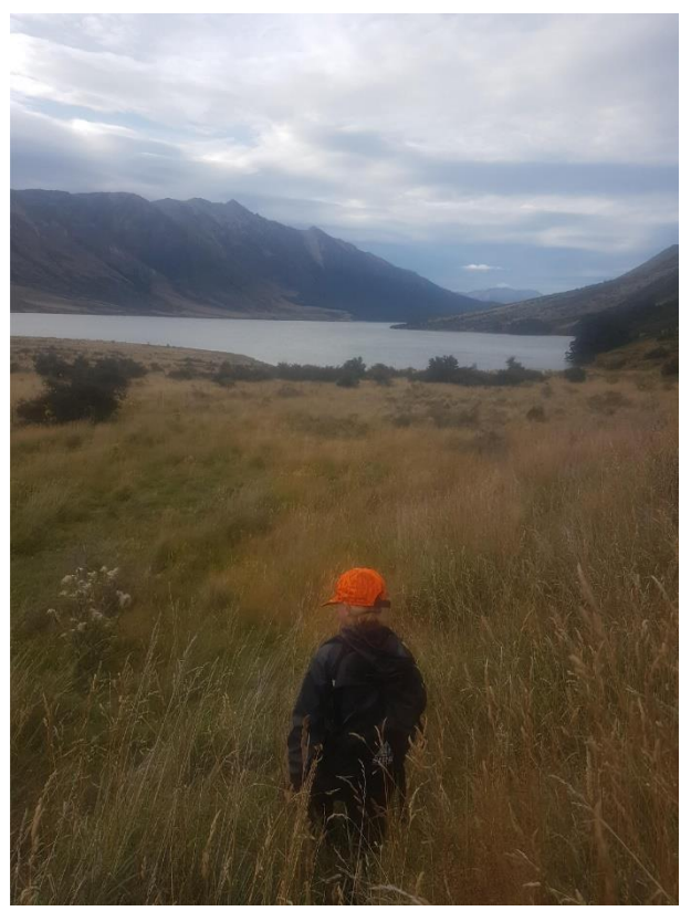
Mavora pre lock down one of my favour places to hunt □