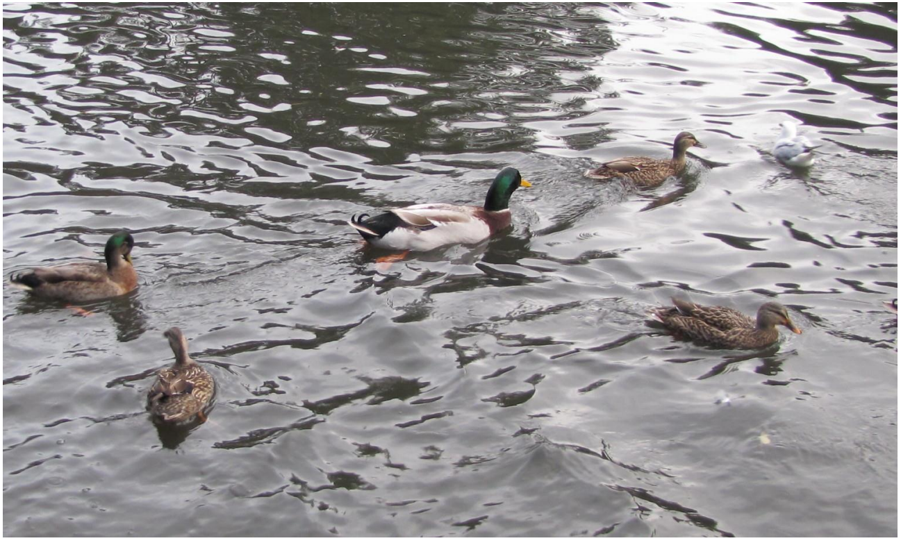
Who said all Mallard Drakes born equal, this trophy Drake was missed opening weekend.