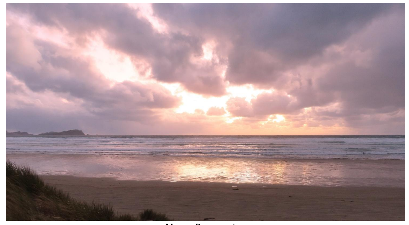
Mason Bay evening