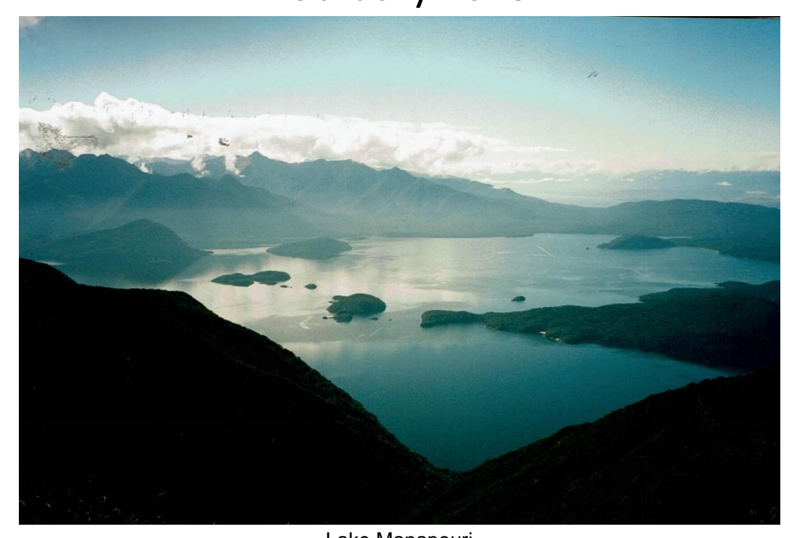
Lake Manapouri Monthly Meeting