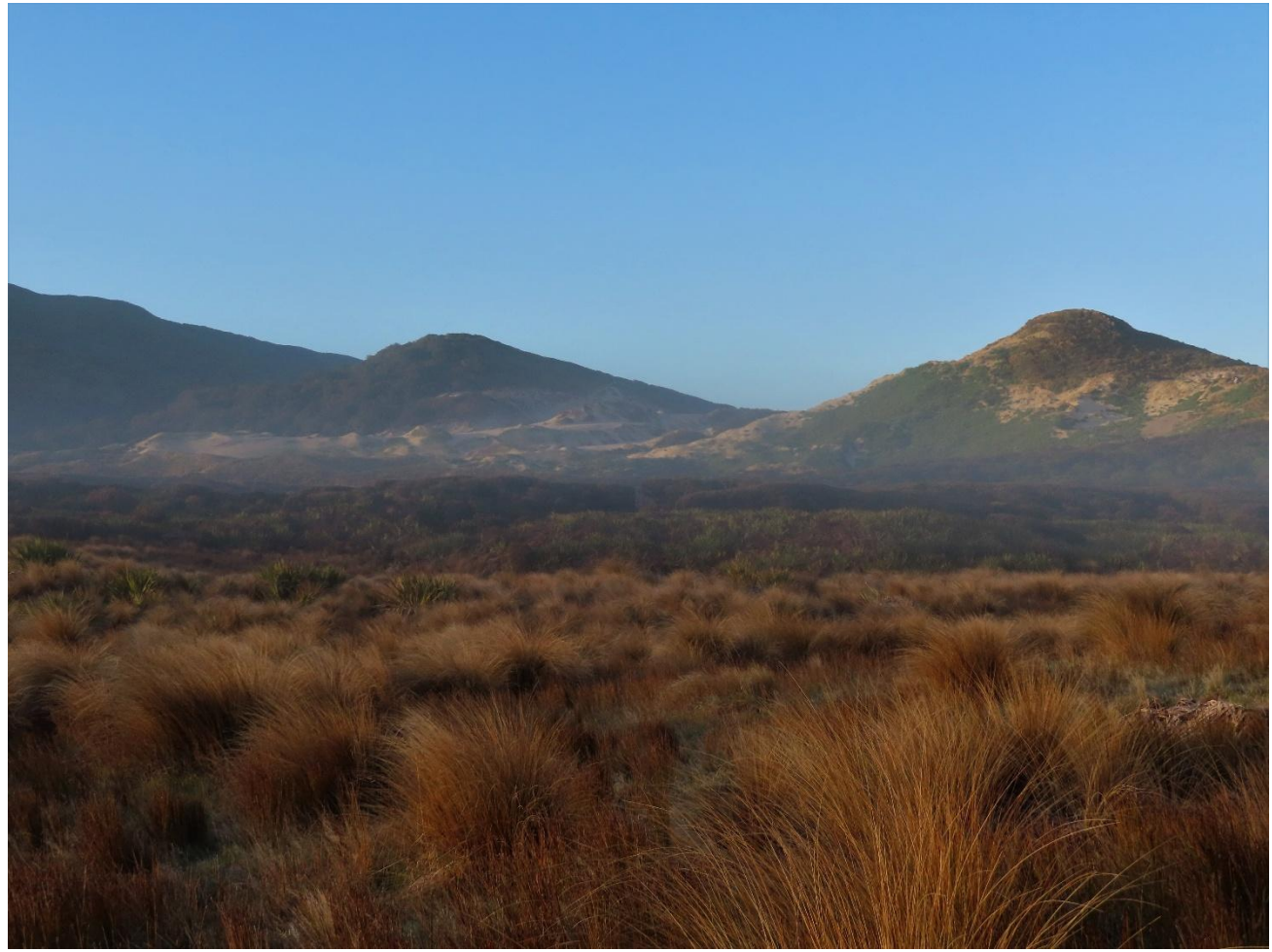
Big Sand Hill Mason Bay